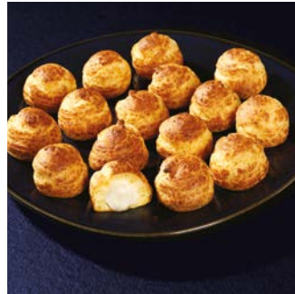
MINI CHEESE BITES