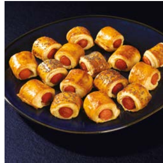
MINI SAUSAGE ROLLS