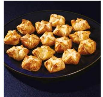
MINI PUFF PASTRIES