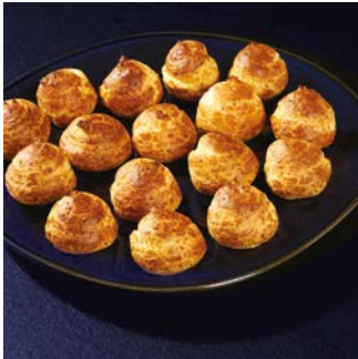
GOUGÈRES CHEESE PUFFS