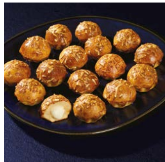
MINI FRENCH BRIOCHES